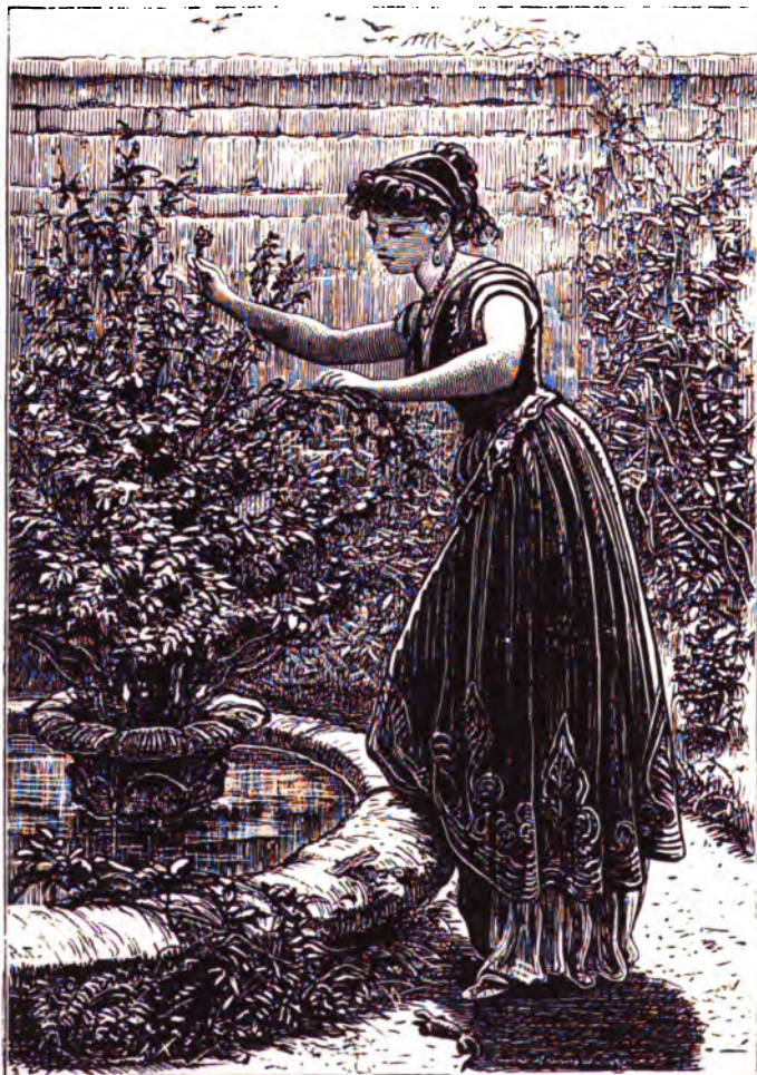
RAPPACCINI'S DAUGHTER. See page 119